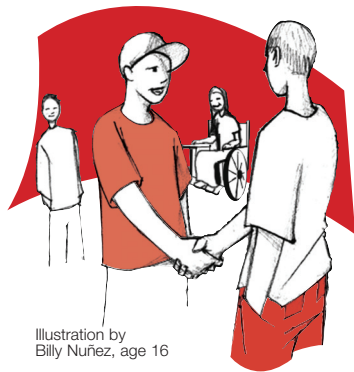
Illustration by Billy Nuñez, age 16